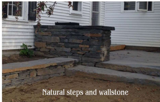
Natural steps and wallstone

Landscaping stone from the Goshen formation for veneer, walls, patios, steps, walkways and other applications.