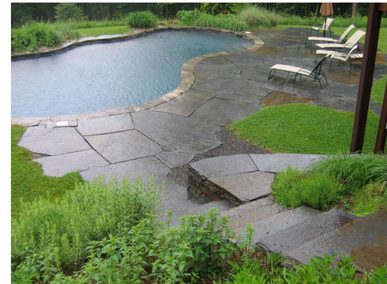
Flagging, Wallstone and Steps